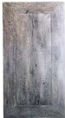
reclaimed timber table mold

Add the extra insurance of SpiderLath "No Strip" to your next cast/ molded project. SpiderLath is the added ingredient to help reduce the occurrence of cracking and adds significant strength to the overall piece.